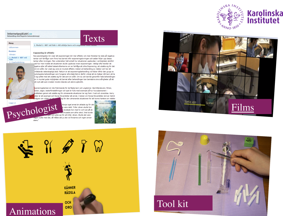
Figure 2. The components of the Internet-based treatment.

Each module ended with homework that contained both knowledge questions based on texts in the modules, as well as practical exercises such as exposures; registrations of, for example, negative thoughts related to dental care; relaxation exercises; and mindfulness. Exposure to dentistry-related video clips and audio files began from module 3. A practice package consisting of dental tools such as a dentist's mirror, dental probe, topical anesthetic, and cannula were sent home to the coach together with detailed instructions for use and safety (tool kit in Figure 2). Parents and children had to complete the assigned homework after each session before they were allowed to progress to the next module. The psychologist sent a message to the participant once a week. Messages consisted of feedback on homework assignment and answers to questions parents or children raised. If the assignments were not completed, reminders were sent to the participant. Exposures at the dental office started after module 6. The psychologists would provide feedback and support on homework assignments to participants within 36 hours on weekdays.